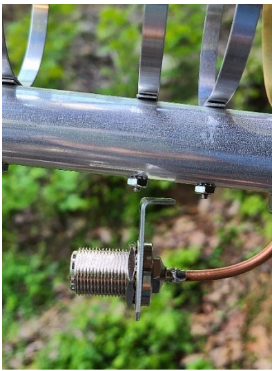
Connector doesn't fit

Now, GENTLY bend the UT-141 coax after it exits the boom towards the front or rear, depending on the mounting. You do not want to bend it so tightly that it crushes where it extends through the bolt. The connector bracket should line up with either D1 or D2 (or the hole with the circle around it on rear mount antennas), remove that nut and place the connector bracket on the screw and re-attach the nut. If the bracket doesn't line up, sometimes you have to flip the bracket. Loosen the <sup>3</sup>/<sub>4</sub>" nut by holding the connector body with a 9/16" open end wrench. Remove the connector bracket and flip it.