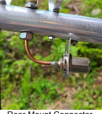
Rear Mount Connector

4) Attach the feed line and tape it to the mast. Seal all connections with silicone RTV or equivalent.