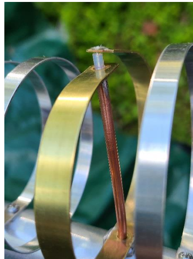
Soldered Driven Element