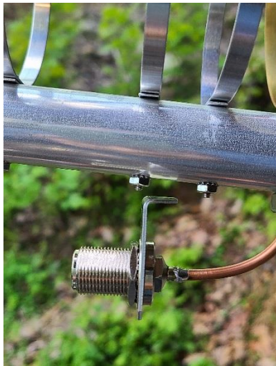
Connector doesn't fit

Now, GENTLY bend the UT-141 coax after it exits the boom towards the front or rear, depending on the mounting. You do not want to bend it so tightly that it crushes where it extends through the bolt. The connector bracket should line up with either D1 or D2 (or the hole with the circle around it on rear mount antennas), remove that nut and place the connector bracket on the screw and re-attach the nut. If the bracket doesn't line up, sometimes you have to flip the bracket. Loosen the 3/4" nut by holding the connector body with a 9/16" open end wrench. Remove the connector bracket and flip it.