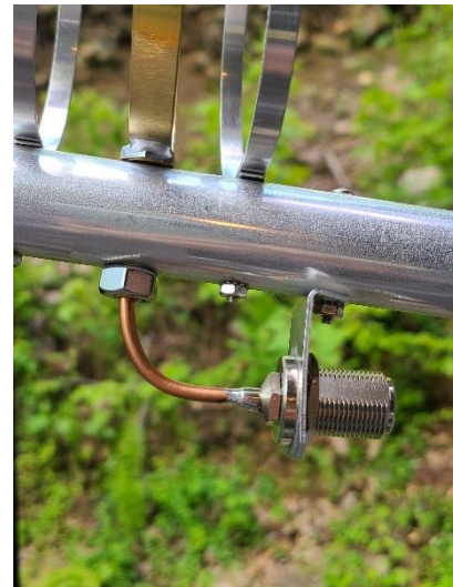
Rear Mount Connector

Refer to photos on the next few steps for clarification.