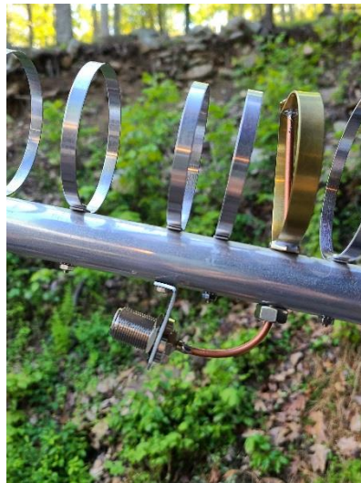
Front Mount Connector