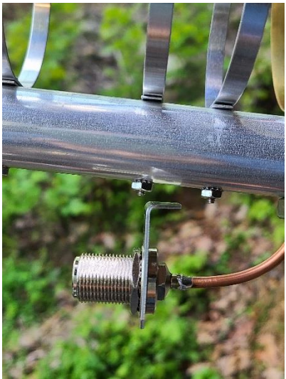
Connector doesn't fit

Now, GENTLY bend the UT-141 coax after it exits the boom towards the front or rear, depending on the mounting. You do not want to bend it so tightly that it crushes where it extends through the bolt. The connector bracket should line up with either D1 or D2 (or the hole with the circle around it on rear mount antennas), remove that nut and place the connector bracket on the screw and re-attach the nut. If the bracket doesn't line up, sometimes you have to flip the bracket. Loosen the <sup>3</sup>/<sub>4</sub>" nut by holding the connector body with a 9/16" open end wrench. Remove the connector bracket and flip it.