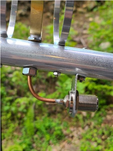
Rear Mount Connector

7) Attach the feedline and tape it to the mast. Seal all connections with silicone RTV or equivalent.