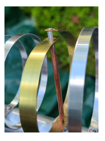
Soldered Driven Element